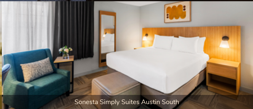
Sonesta Simply Suites Austin South