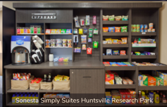
Sonesta Simply Suites Huntsville Research Park