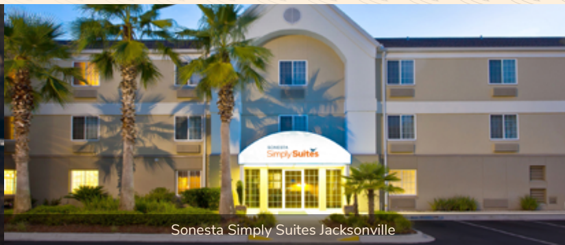
Sonesta Simply Suites Jacksonville