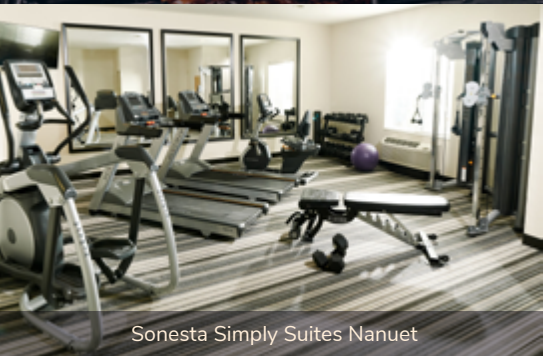
Sonesta Simply Suites Nanuet