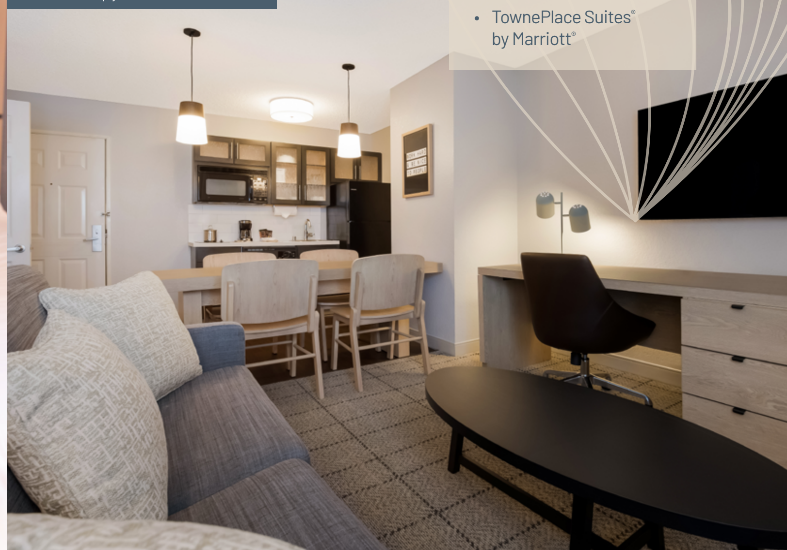
Sonesta Simply Suites Irvine Foothill East