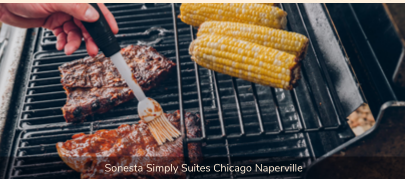
Sonesta Simply Suites Chicago Naperville