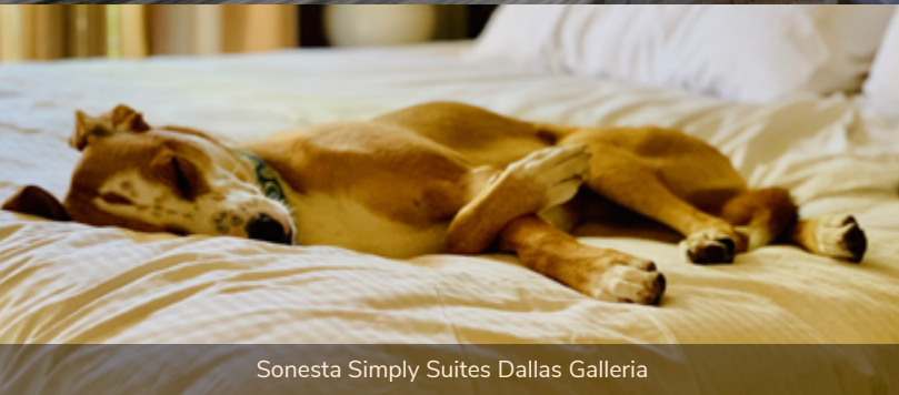
Sonesta Simply Suites Dallas Galleria