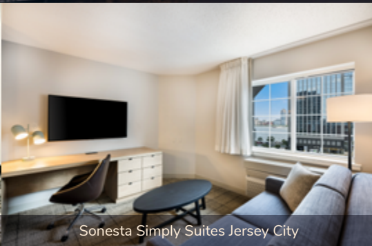
Sonesta Simply Suites Jersey City