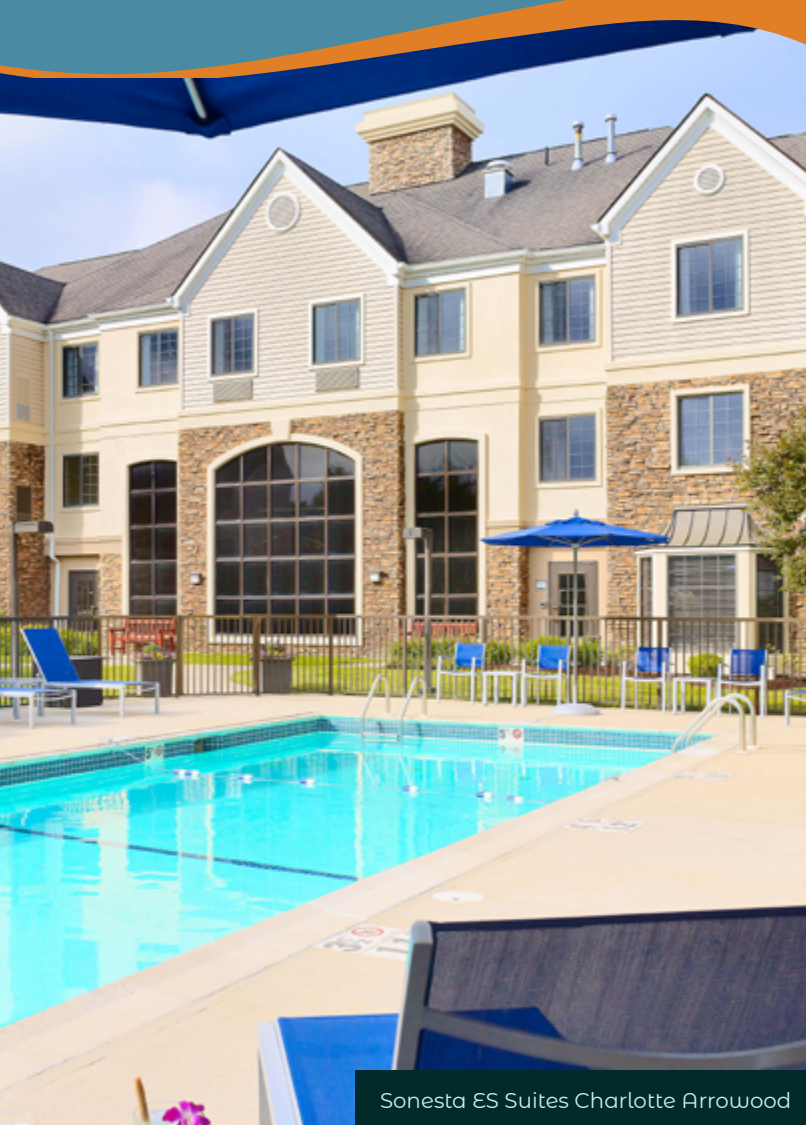
Sonesta ES Suites Charlotte Arrowood