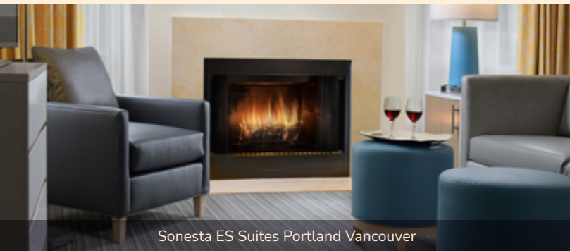
Sonesta ES Suites Portland Vancouver