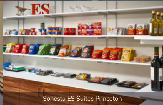
Sonesta ES Suites Princeton