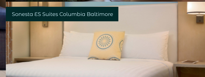
Sonesta ES Suites Columbia Baltimore