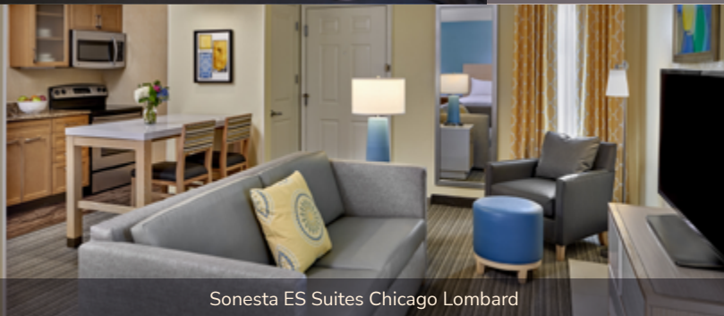
Sonesta ES Suites Chicago Lombard