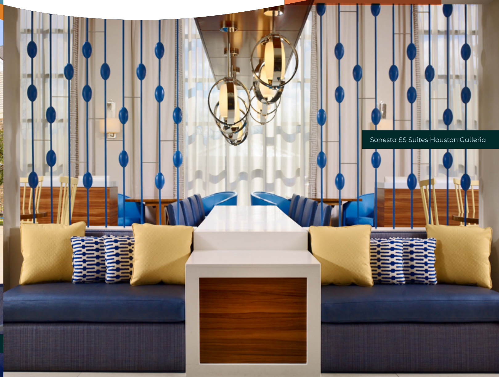
Sonesta ES Suites Houston Galleria