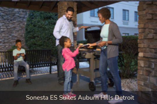
Sonesta ES Suites Auburn Hills Detroit