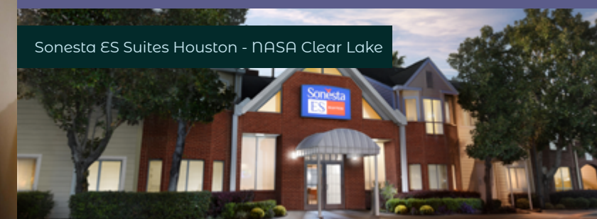
Sonesta ES Suites Houston - NASA Clear Lake