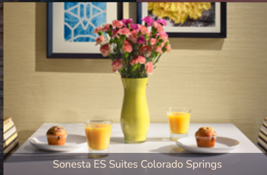
Sonesta ES Suites Colorado Springs