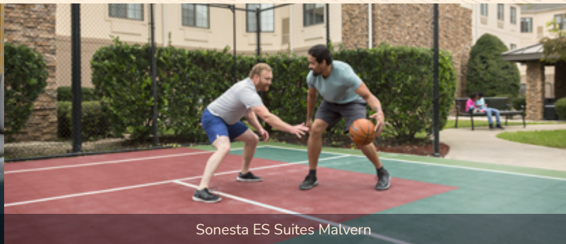
Sonesta ES Suites Malvern