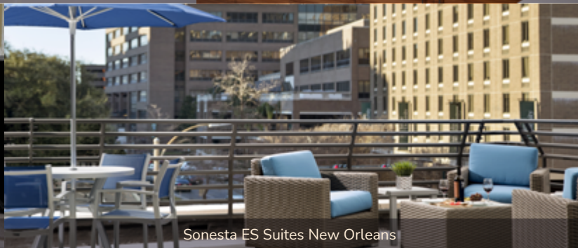
Sonesta ES Suites New Orleans