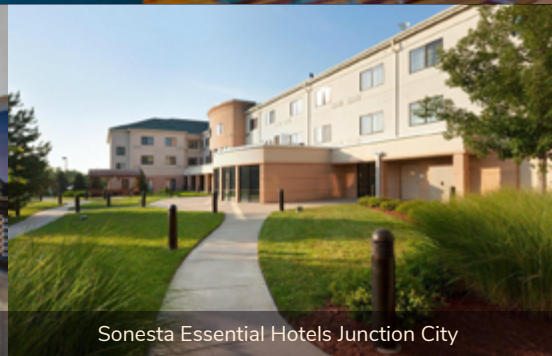
Sonesta Essential Hotels Junction City