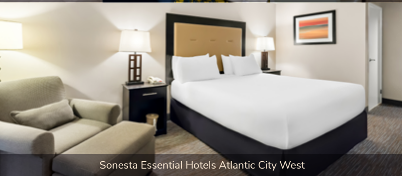
Sonesta Essential Hotels Atlantic City West