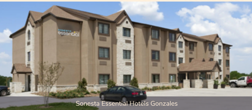
Sonesta Essential Hotels Gonzales