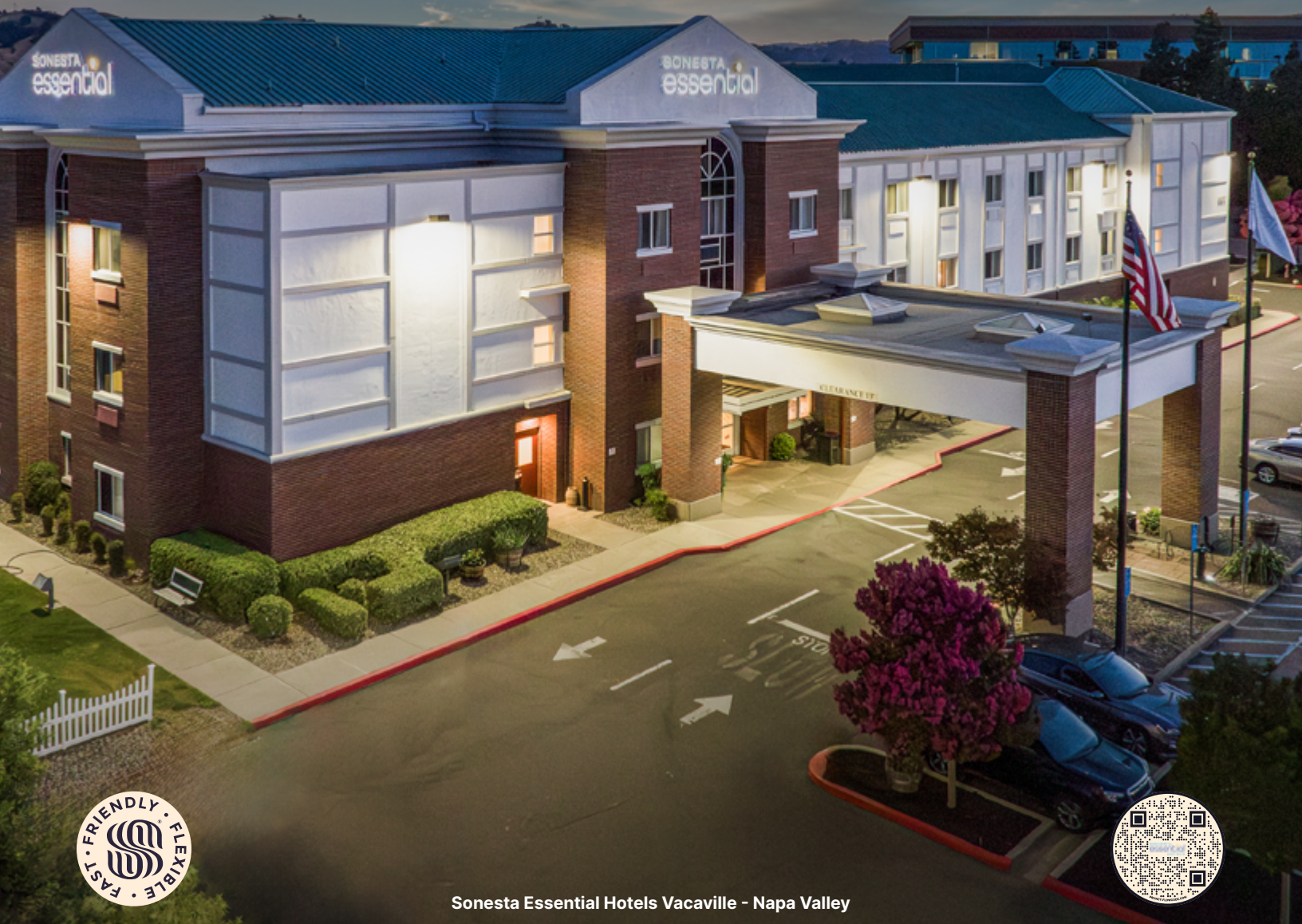
Sonesta Essential Hotels Vacaville - Napa Valley