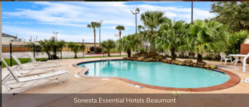
Sonesta Essential Hotels Beaumont