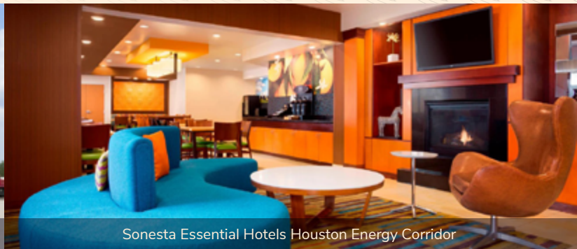
Sonesta Essential Hotels Houston Energy Corridor