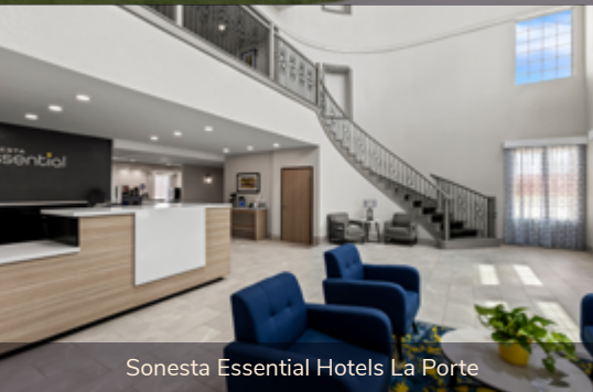
Sonesta Essential Hotels La Porte