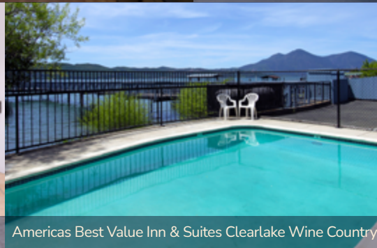
Americas Best Value Inn & Suites Clearlake Wine Country