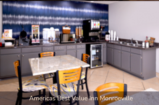
Americas Best Value Inn Monroeville