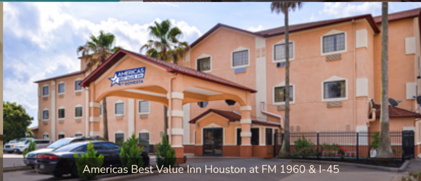
Americas Best Value Inn Houston at FM 1960 & I-45