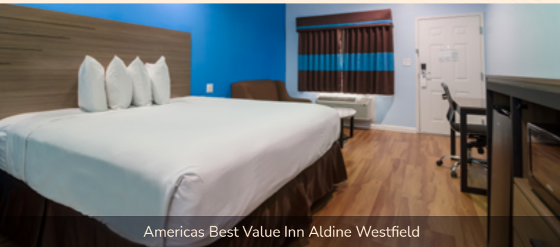
Americas Best Value Inn Aldine Westfield