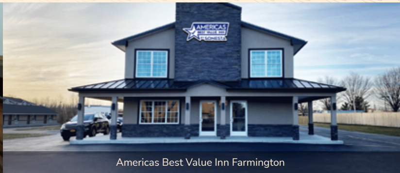
Americas Best Value Inn Farmington