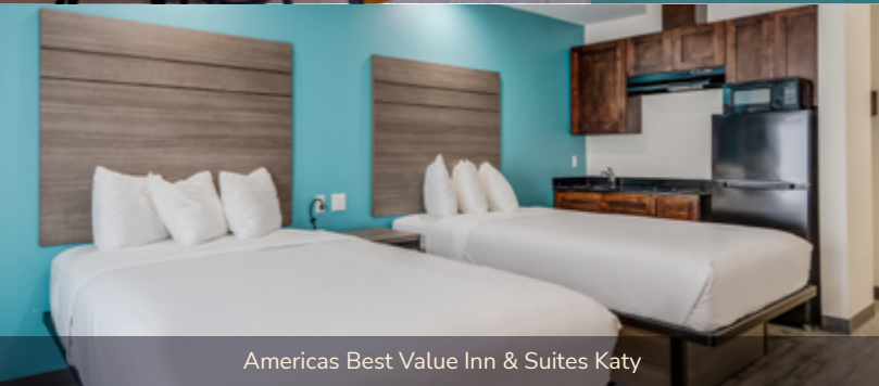
Americas Best Value Inn & Suites Katy