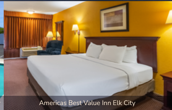
Americas Best Value Inn Elk City