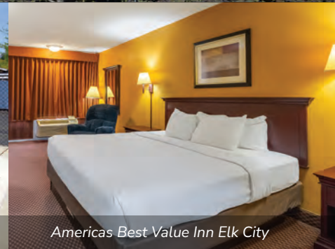
Americas Best Value Inn Elk City