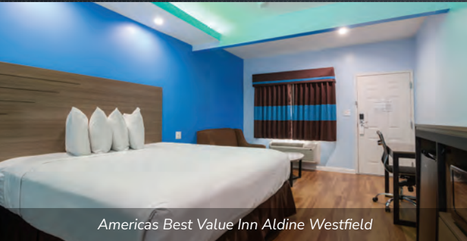
Americas Best Value Inn Aldine Westfield

17 brands | 1,200+ properties | 100,000+ rooms