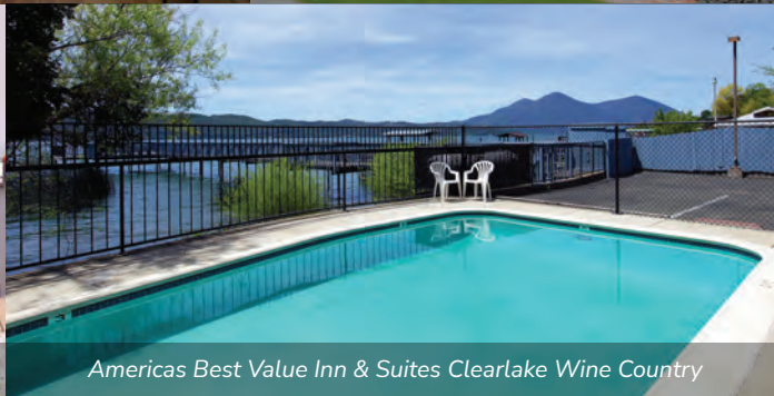
Americas Best Value Inn & Suites Clearlake Wine Country