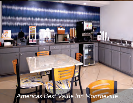
Americas Best Value Inn Monroeville