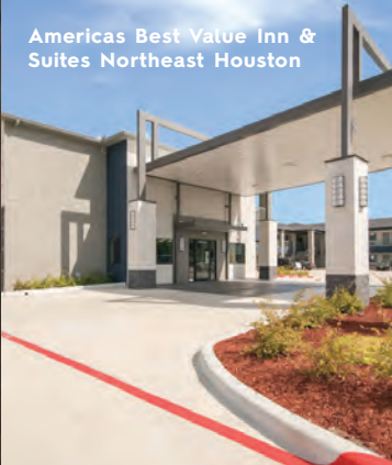
Americas Best Value Inn & Suites Northeast Houston