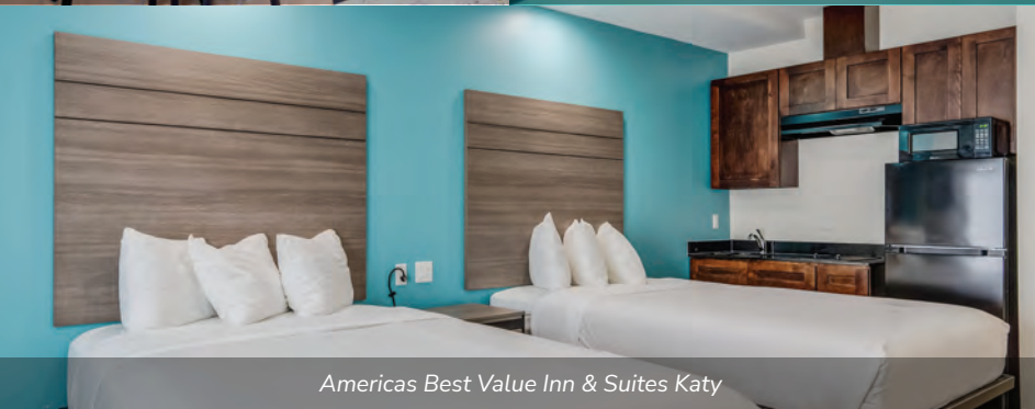
Americas Best Value Inn & Suites Katy