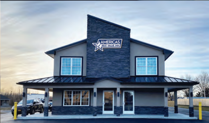
Americas Best Value Inn Farmington

Hotels pay no Hello Rewards fees on stays that earn Hello Bucks.