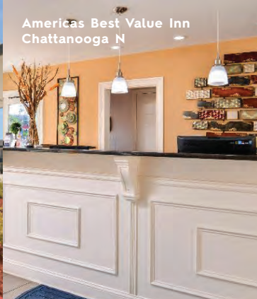
Americas Best Value Inn Chattanooga N