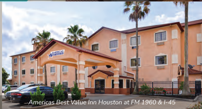
Americas Best Value Inn Houston at FM 1960 & I-45