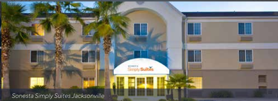
Sonesta Simply Suites Jacksonville