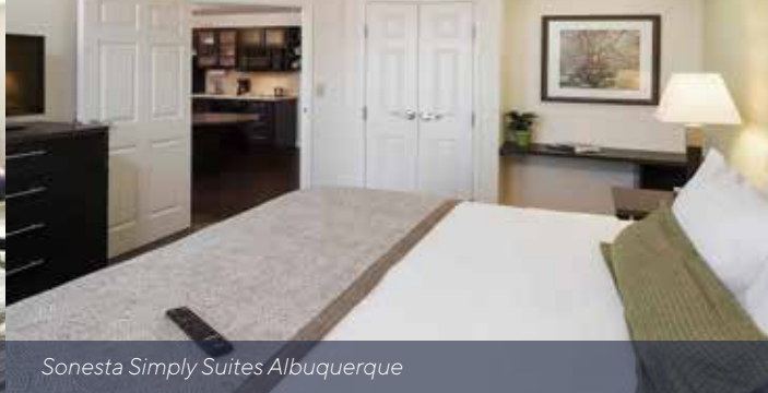
Sonesta Simply Suites Albuquerque