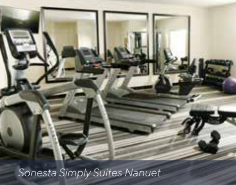
Sonesta Simply Suites Nanuet