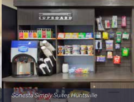
Sonesta Simply Suites Huntsville