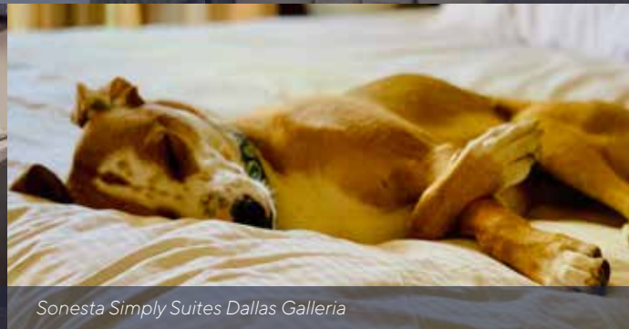
Sonesta Simply Suites Dallas Galleria