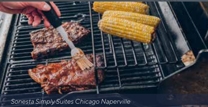
Sonesta Simply Suites Chicago Naperville

17 BRANDS | 1200+ PROPERTIES | 100,000+ ROOMS