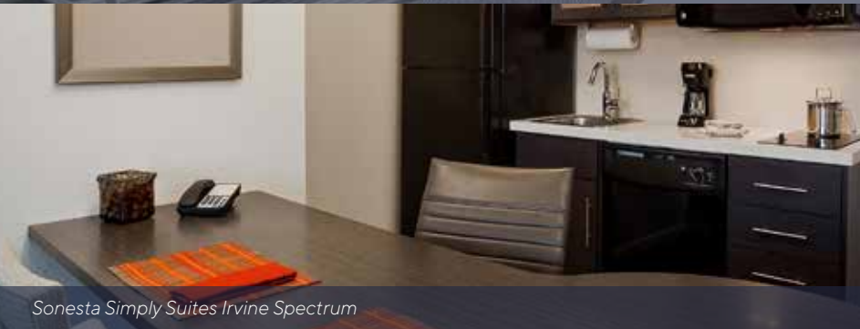
Sonesta Simply Suites Irvine Spectrum