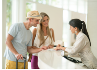
GUEST SATISFACTION AND REPUTATION MANAGEMENT PLATFORMS