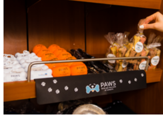
PET WELCOMING PROGRAM