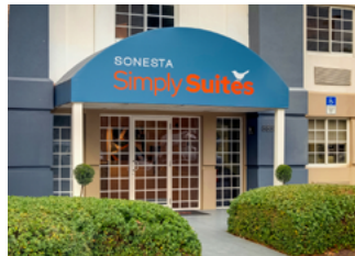
BRAND IDENTITY, DESIGN, AND SIGNAGE GUIDELINES