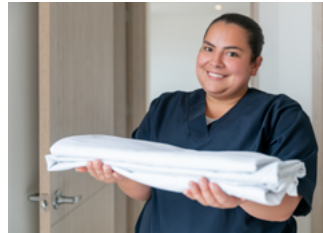
SONESTA SUPPLIER ALLIANCE (SSA) PROCUREMENT PLATFORMS