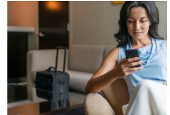
GUEST EXPERIENCE AND ENTERTAINMENT PLATFORMS