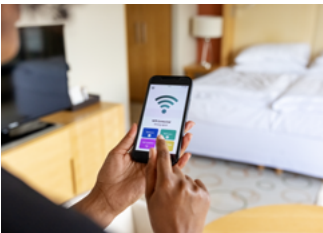
COMPLIMENTARY BASIC GUEST WI-FI