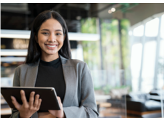
TECHNOLOGY INFRASTRUCTURE AND HOTEL OPERATIONAL PLATFORMS