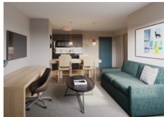
ARCHITECTURE, DESIGN AND CONSTRUCTION STANDARDS