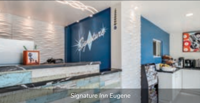
Signature Inn Eugene

15 brands | 1,100+ properties | 100,000+ rooms