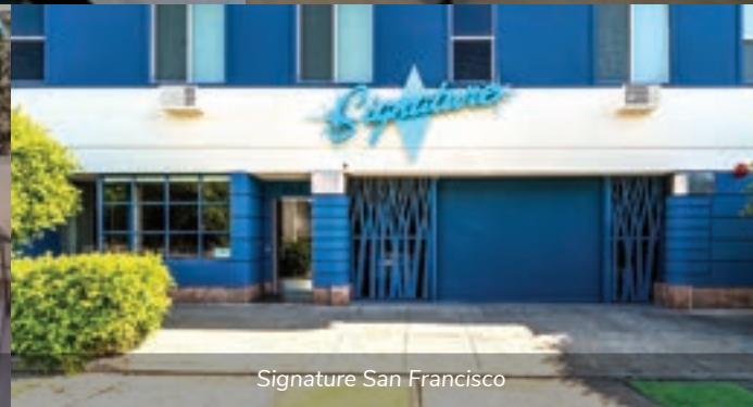
Signature San Francisco