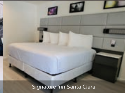
Signature Inn Santa Clara