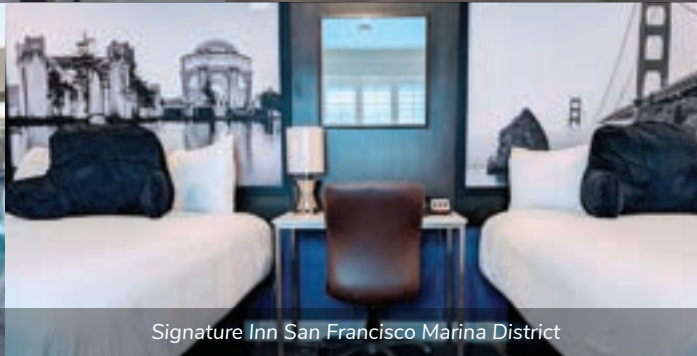
Signature Inn San Francisco Marina District