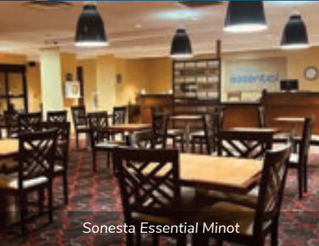
Sonesta Essential Minot