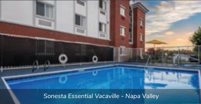
Sonesta Essential Vacaville - Napa Valley

15 brands | 1,100+ properties | 100,000+ rooms