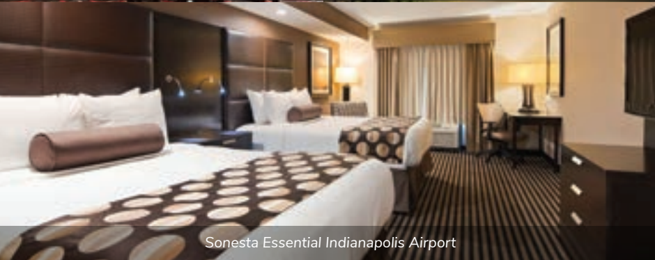
Sonesta Essential Indianapolis Airport