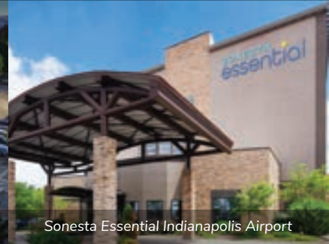
Sonesta Essential Indianapolis Airport