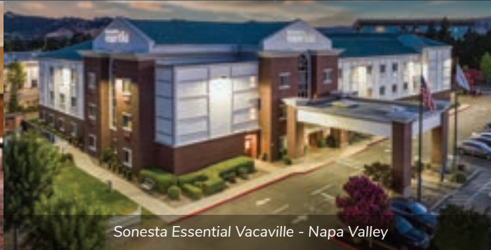
Sonesta Essential Vacaville - Napa Valley