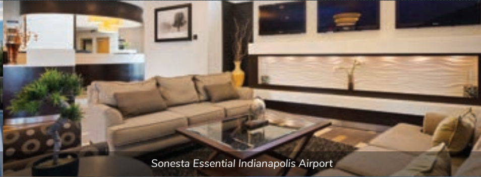
Sonesta Essential Indianapolis Airport