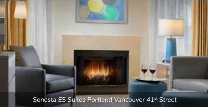
Sonesta ES Suites Portland Vancouver 41 st Street

15 brands | 1,100+ properties | 100,000+ rooms