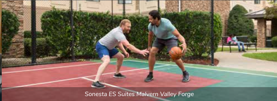
Sonesta ES Suites Malvern Valley Forge