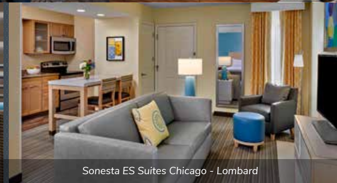
Sonesta ES Suites Chicago - Lombard