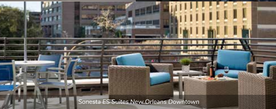
Sonesta ES Suites New Orleans Downtown