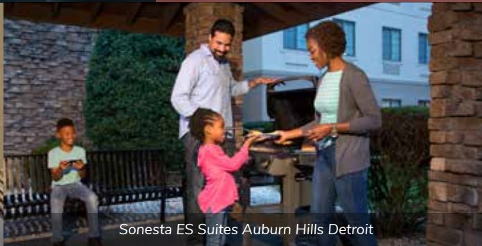
Sonesta ES Suites Auburn Hills Detroit