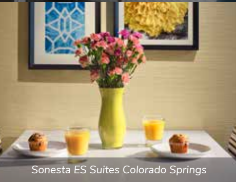
Sonesta ES Suites Colorado Springs