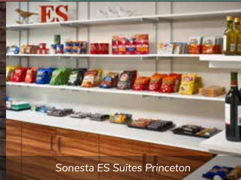
Sonesta ES Suites Princeton