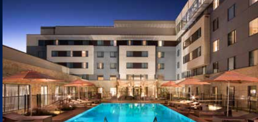
Sonesta Bee Cave Austin

Sonesta, the 8 th largest hotel company in the U.S., has its foundation in the integration of Sonesta International Hotels Corporation and Red Lion Hotels Corporation. These two entities trace back to 1937, and today, over 85 years later, are united with 15 brands, 1,100+ hotels, throughout 8 countries.