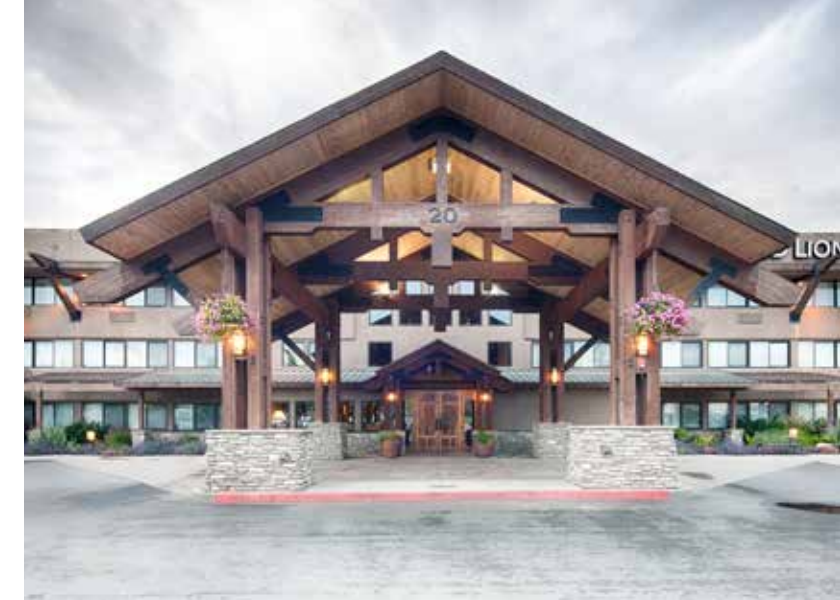
Red Lion Hotel Kalispell