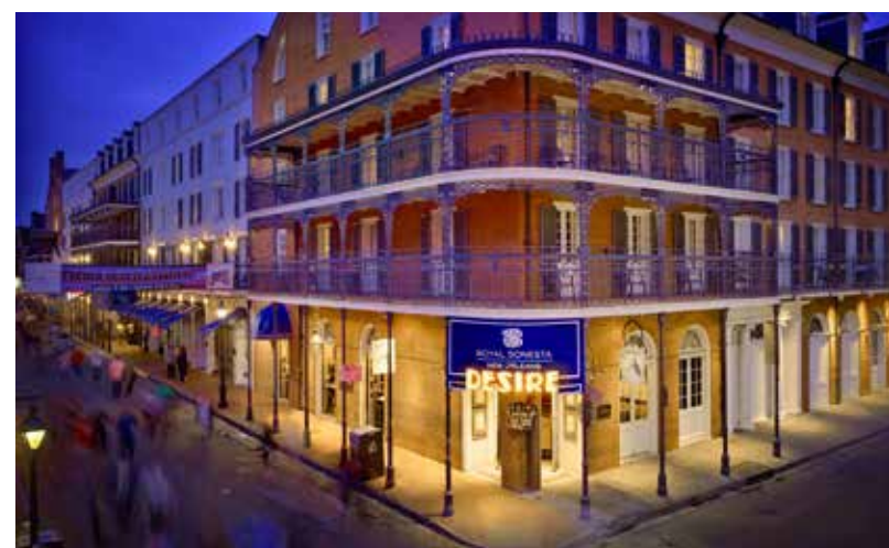
The Royal Sonesta New Orleans

In 1995 Red Lion went public and in 1996 was acquired by Doubletree . In 2001, G&B (using the name Cavanaugh’s and then WestCoast Hospitality) grew again, acquiring Red Lion Hotels brand and properties from Hilton (who had recently acquired Doubletree). The $51M acquisition expanded the footprint to include every western state but New Mexico and created a portfolio of 90 hotels and 15,000 rooms most of which were rebranded as Red Lion.