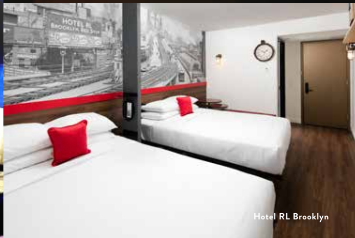
Hotel RL Brooklyn