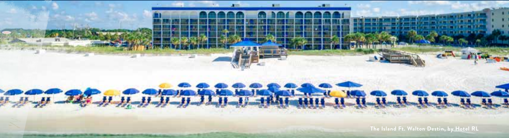
The Island Ft. Walton Destin, by Hotel RL

17 POWERFUL BRANDS | 1,200+ PROPERTIES | 100,000+ ROOMS