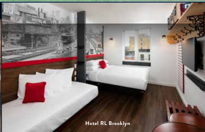
Hotel RL Brooklyn