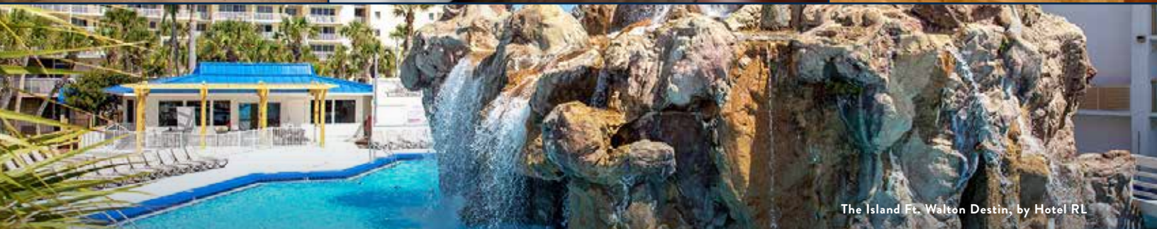
The Island Ft. Walton Destin, by Hotel RL