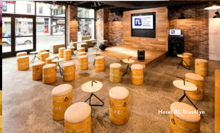
Hotel RL Brooklyn