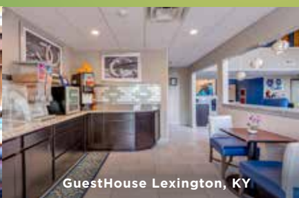
GuestHouse Lexington, KY