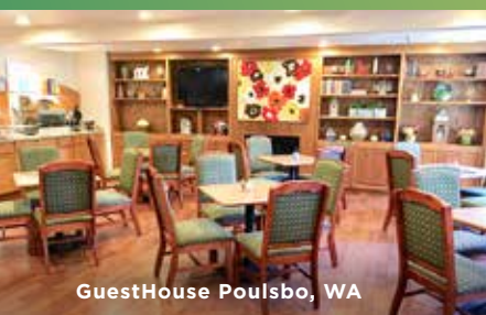
GuestHouse Poulsbo, WA