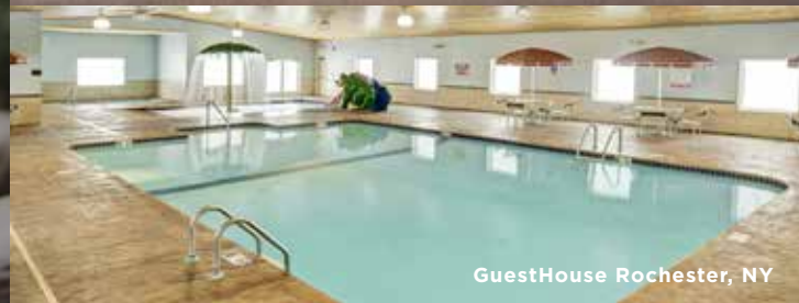
GuestHouse Rochester, NY