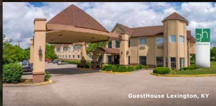
GuestHouse Lexington, KY

Hotels pay no Hello Rewards fees on stays that earn Hello Bucks.