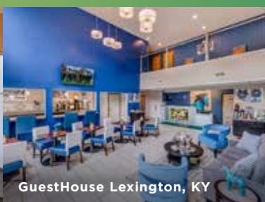
GuestHouse Lexington, KY