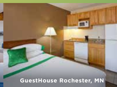
GuestHouse Rochester, MN