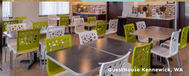
GuestHouse Kennewick, WA