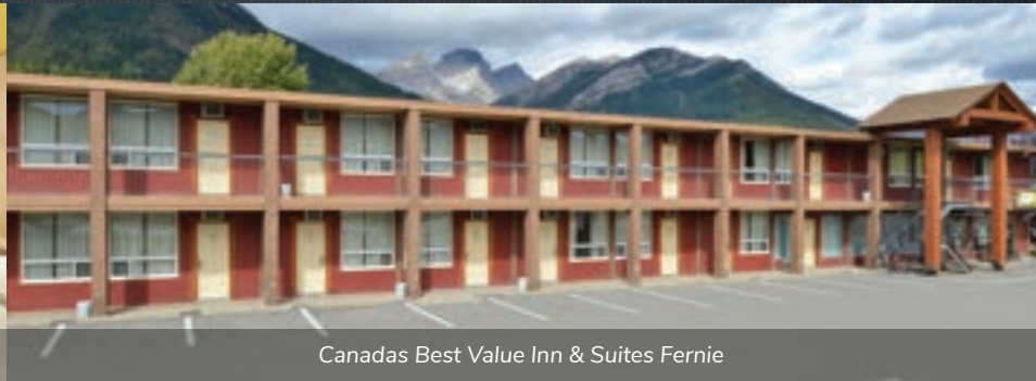
Canadas Best Value Inn & Suites Fernie