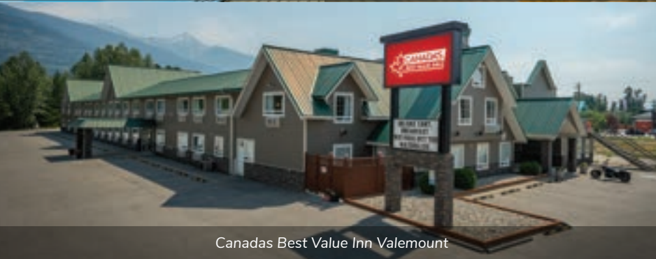
Canadas Best Value Inn Valemount