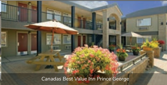
Canadas Best Value Inn Prince George