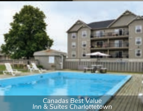
Canadas Best Value Inn & Suites Charlottetown