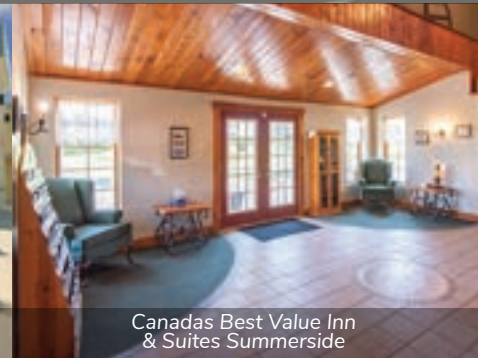
Canadas Best Value Inn & Suites Summerside