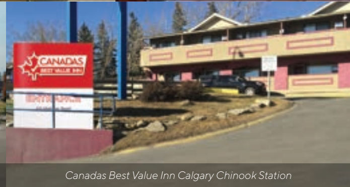
Canadas Best Value Inn Calgary Chinook Station