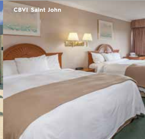
CBVI Saint John