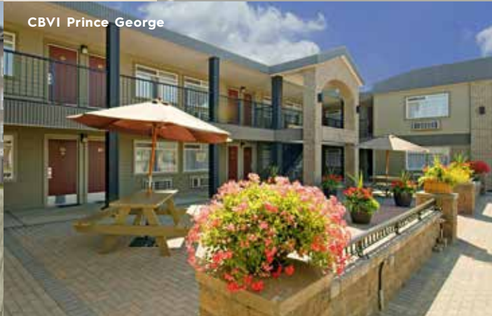
CBVI Prince George