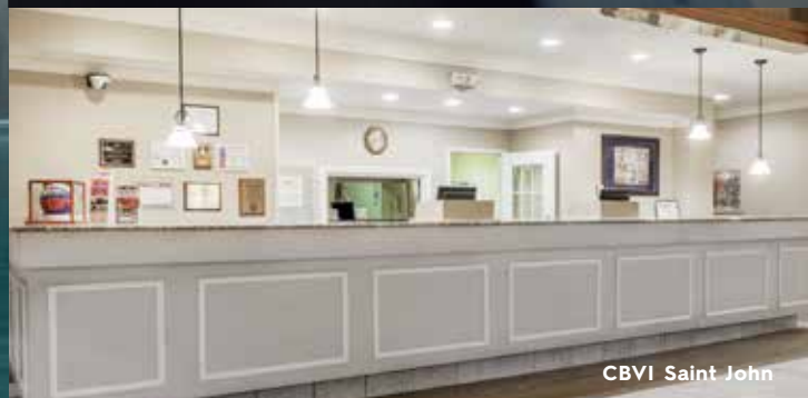
CBVI Saint John

Hotels pay no Hello Rewards fees on stays that earn Hello Bucks.