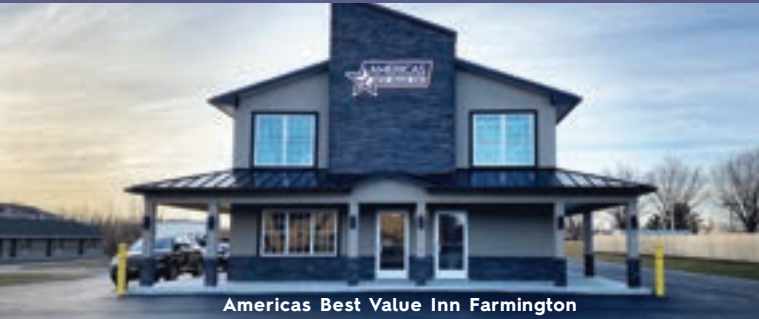
Americas Best Value Inn Farmington