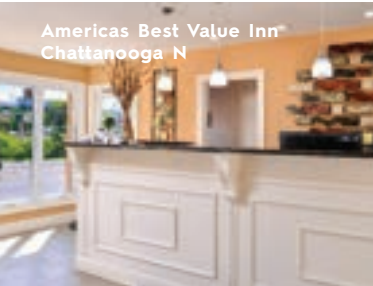
Americas Best Value Inn Chattanooga N