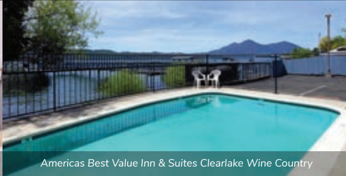
Americas Best Value Inn & Suites Clearlake Wine Country