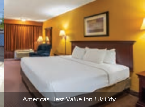
Americas Best Value Inn Elk City