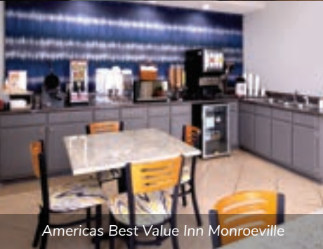
Americas Best Value Inn Monroeville