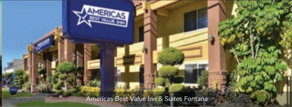
Americas Best Value Inn & Suites Fontana