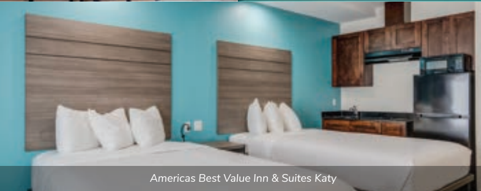
Americas Best Value Inn & Suites Katy