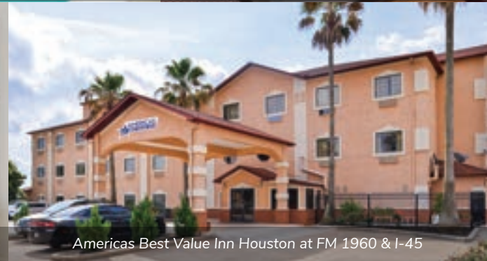
Americas Best Value Inn Houston at FM 1960 & I-45