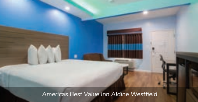
Americas Best Value Inn Aldine Westfield

15 brands | 1,100+ properties | 100,000+ rooms