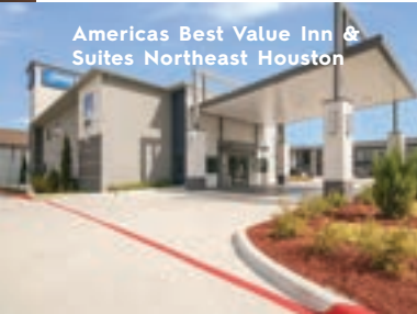
Americas Best Value Inn & Suites Northeast Houston