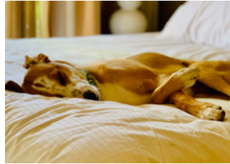
PET WELCOMING PROGRAM