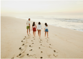
SONESTA TRAVEL PASS LOYALTY PROGRAM

Our Core Brand Standards are what we are known for, and ensure your guests have a comfortable and consistent experience no matter which location they visit. These are required touchpoints that are reflected throughout every aspect of Americas Best Value Inn brand hotels.