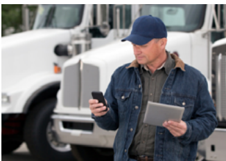
COMPLIMENTARY BASIC GUEST WI-FI