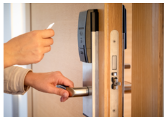
GUEST SAFETY AND SECURITY STANDARDS

Defining Brand Standards and Signature Moments subject to change. Additional core brand standards may apply, consult the current brand standards manual and resources located on the Sonesta QA site or Brand Hub.