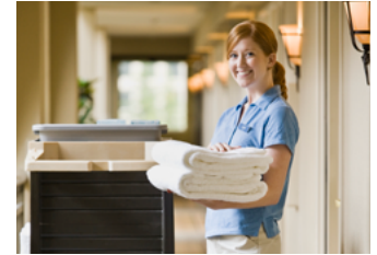
QUALITY ASSURANCE PROGRAM