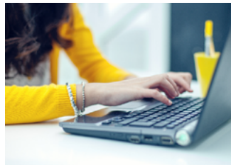
LEARNING, DEVELOPMENT AND BRAND GUIDANCE PLATFORMS