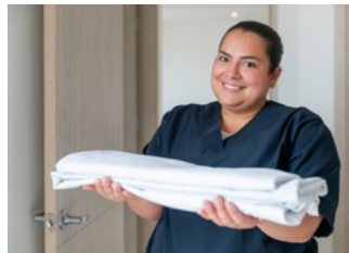
SONESTA SUPPLIER ALLIANCE (SSA) PROCUREMENT PLATFORMS