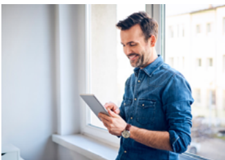
TECHNOLOGY INFRASTRUCTURE AND HOTEL OPERATIONAL PLATFORMS