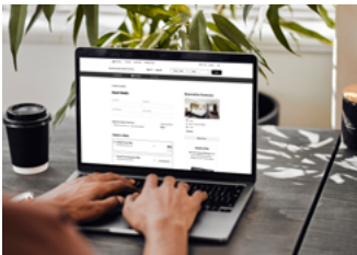
SONESTA REVENUE AND DISTRIBUTION PROGRAMS