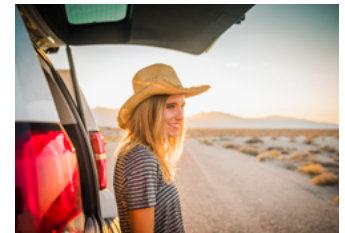
GUEST EXPERIENCE AND ENTERTAINMENT PLATFORMS