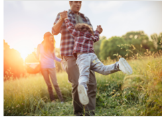
GUEST SATISFACTION AND REPUTATION MANAGEMENT PLATFORMS