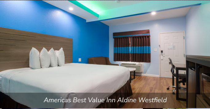
Americas Best Value Inn Aldine Westfield

13 brands | 1,100+ properties | 100,000+ rooms