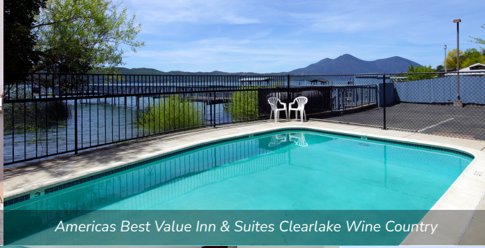
Americas Best Value Inn & Suites Clearlake Wine Country