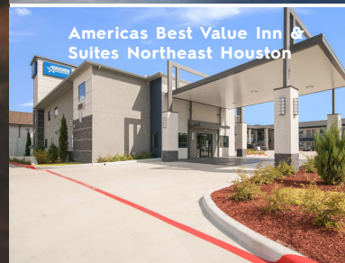
Americas Best Value Inn & Suites Northeast Houston