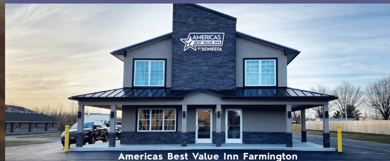
Americas Best Value Inn Farmington