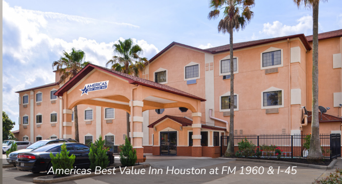
Americas Best Value Inn Houston at FM 1960 & I-45