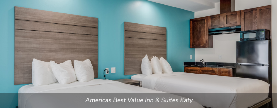
Americas Best Value Inn & Suites Katy