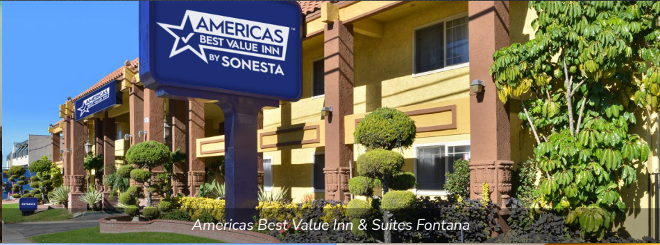
Americas Best Value Inn & Suites Fontana