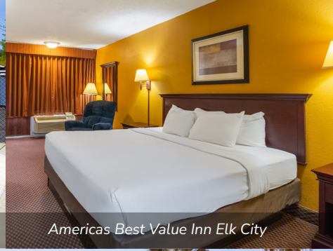
Americas Best Value Inn Elk City