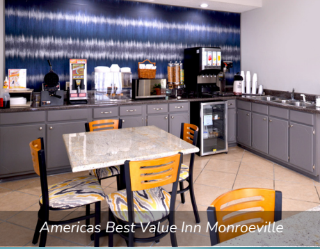
Americas Best Value Inn Monroeville