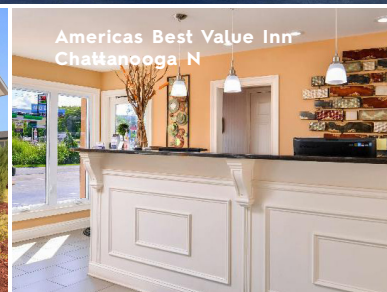
Americas Best Value Inn Chattanooga N