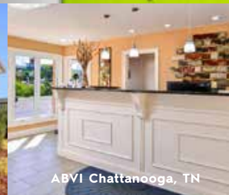
ABVI Chattanooga, TN