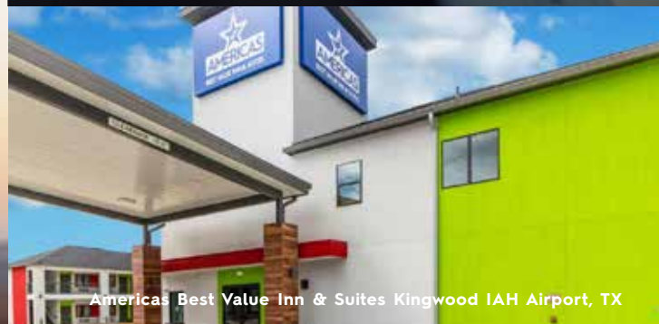
Americas Best Value Inn & Suites Kingwood IAH Airport, TX