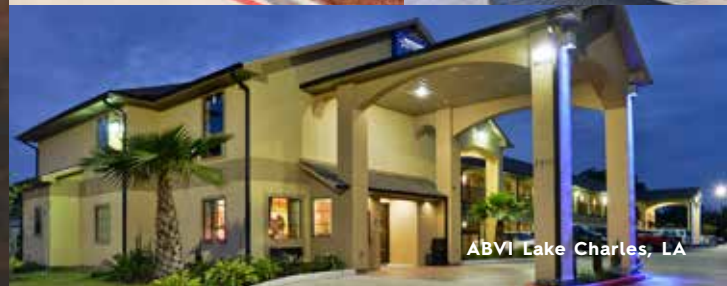
ABVI Lake Charles, LA