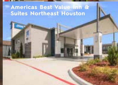
Americas Best Value Inn & Suites Northeast Houston