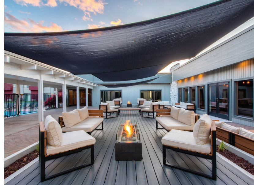
Red Lion Hotel Kennewick Columbia Center