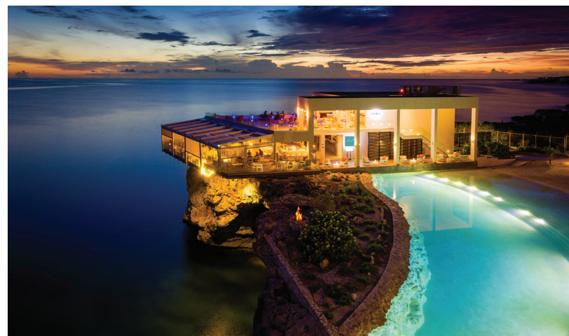
Sonesta Ocean Point Resort - Sint Maarten

In 1995 Red Lion went public and in 1996 was acquired by Doubletree . In 2001, G&B (using the name Cavanaughs and then WestCoast Hospitality) grew again, acquiring Red Lion Hotels brand and properties from Hilton (who had recently acquired Doubletree). The $51M acquisition expanded the footprint to include every western state but New Mexico and created a portfolio of 90 hotels and 15,000 rooms most of which were rebranded as Red Lion.