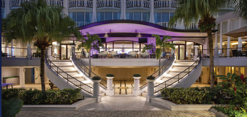
The Royal Sonesta San Juan

Sonesta, the 8 th largest hotel company in the U.S., has its foundation in the integration of Sonesta International Hotels Corporation and Red Lion Hotels Corporation. These two entities trace back to 1937, and today, over 85 years later, are united with 13 brands, 1,100+ hotels, throughout 9 countries.