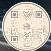
The Royal Sonesta Chicago Downtown