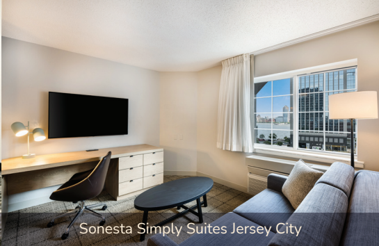
Sonesta Simply Suites Jersey City