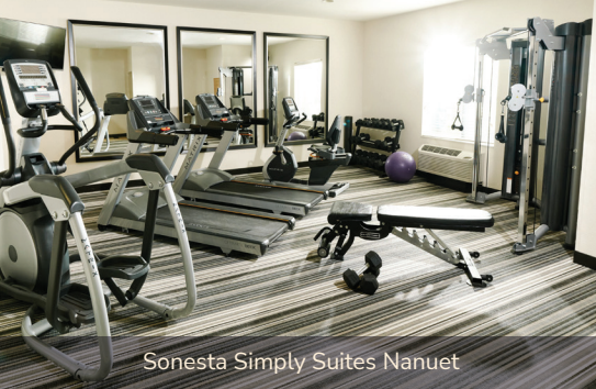
Sonesta Simply Suites Nanuet