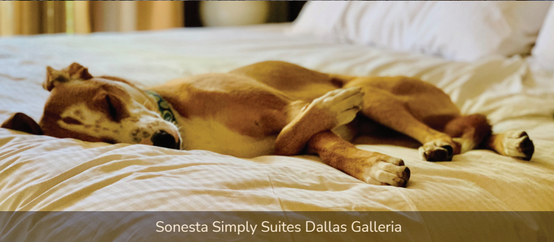
Sonesta Simply Suites Dallas Galleria