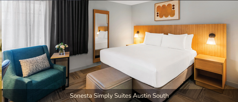
Sonesta Simply Suites Austin South