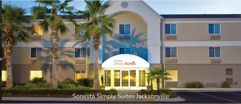
Sonesta Simply Suites Jacksonville