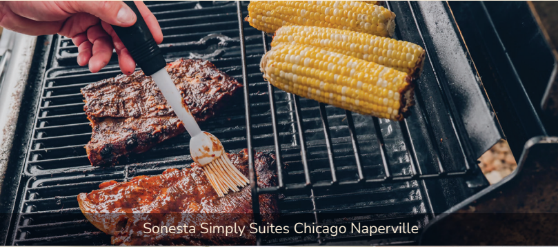
Sonesta Simply Suites Chicago Naperville

8 th LARGEST hotel company in the US | 1,100+ properties | 13 brands | 1 POWERFUL loyalty program 100,000+ rooms | 9 countries