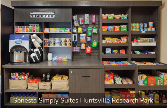
Sonesta Simply Suites Huntsville Research Park