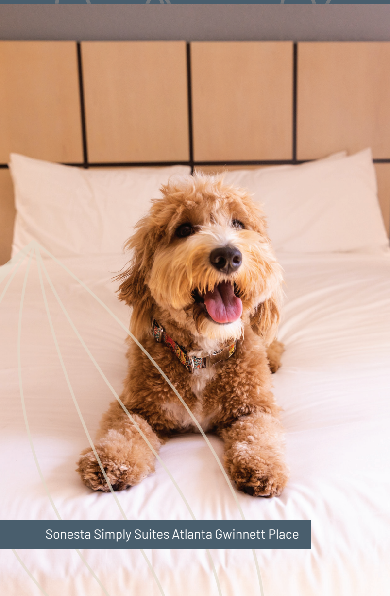
Sonesta Simply Suites Atlanta Gwinnett Place