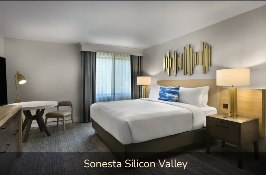
Sonesta Silicon Valley