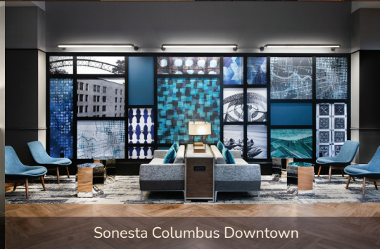
Sonesta Columbus Downtown