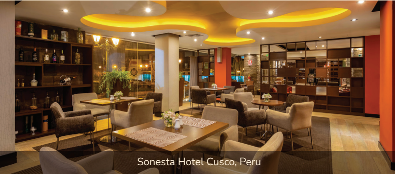
Sonesta Hotel Cusco, Peru

8 th LARGEST hotel company in the US | 1,100+ properties | 13 brands | 1 POWERFUL loyalty program 100,000+ rooms | 9 countries