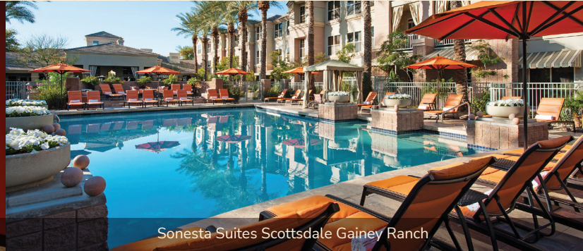
Sonesta Suites Scottsdale Gainey Ranch