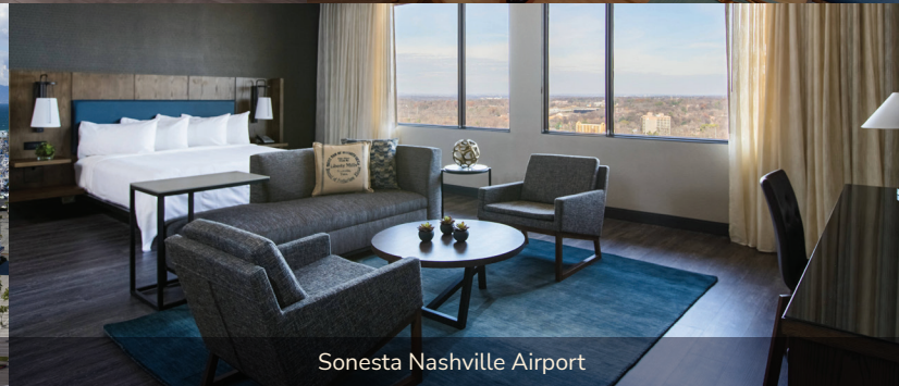
Sonesta Nashville Airport