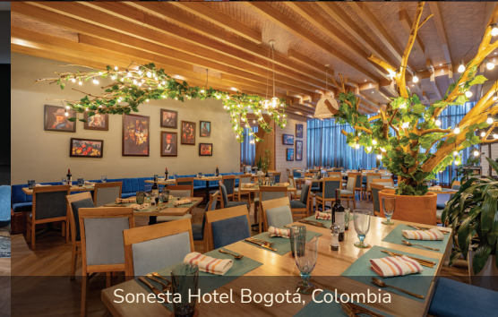
Sonesta Hotel Bogotá, Colombia