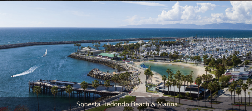
Sonesta Redondo Beach & Marina